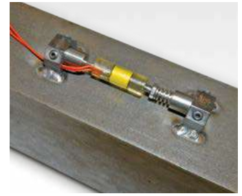
Model 4150 shown with optional arc-weldable mounting blocks.

Accessories include setting tools, capacitive discharge welder (for spot welding) and epoxy kits (for bonded applications).