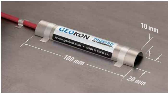
Model 4150 under the Model 4150-1 protective cover plate, with dimensions.