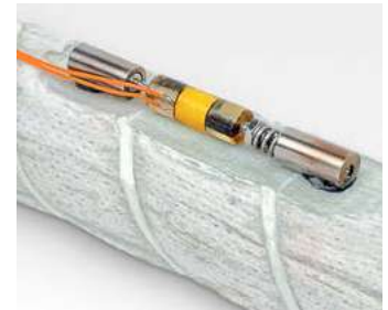
Model 4151 Strain Gauge mounted to a fiberglass rebar.