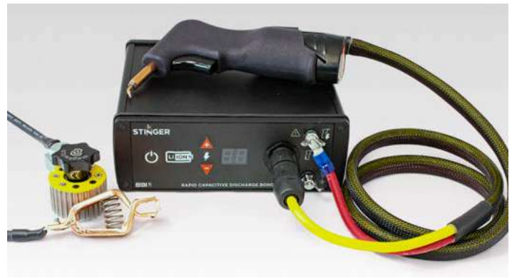
Model 4100-WLD Stinger spot welding kit.