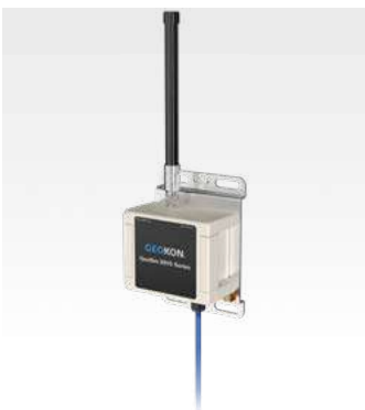
GeoNet Vibrating Wire Data Logger.